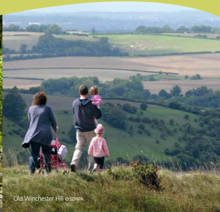
Old Winchester Hill